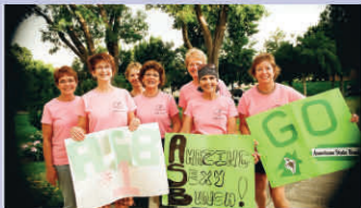
ASB Awesome Cheerleaders!